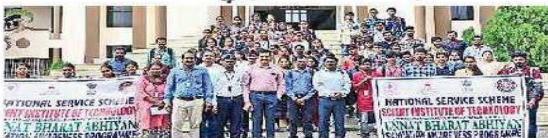
సైయంట్ కళాశాల వద్ద విద్యార్థులు, అధ్యాపకులు