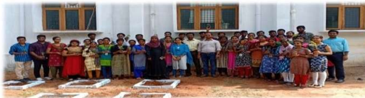
Fig 1 : Plantation of Medicinal plants