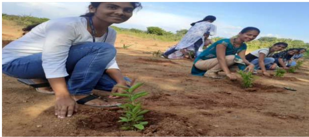
Fig 1 : Students planting saplings around campus premises