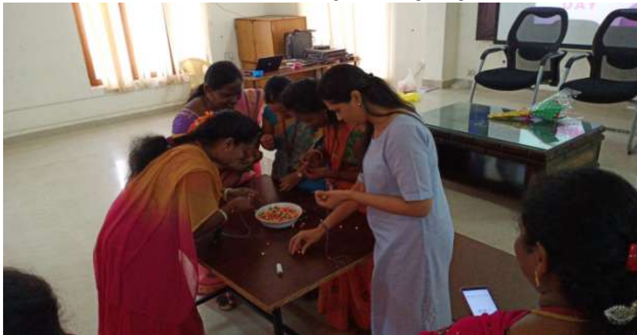
Fig 1 :Students and faculty at International women’s day