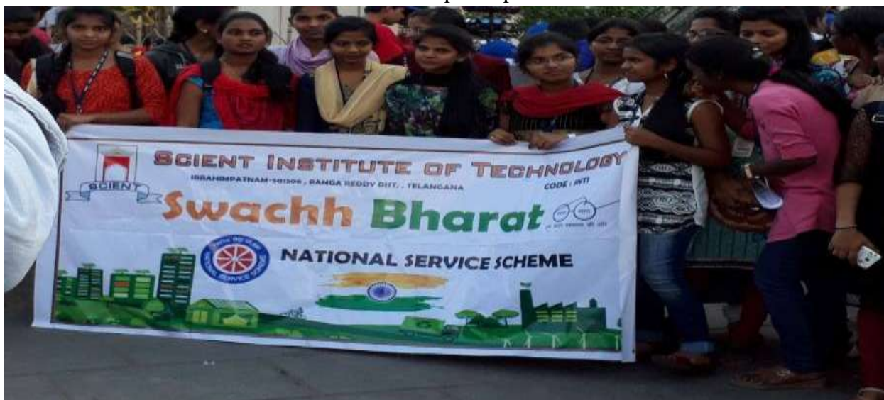
Fig 1 : Students at Swachh bharat

The NSS Cell – SNTI organized “Swachh bharat” on 07-02-2017 around campus. The mission was started with the Swachta Pledge. The main motto of this program is to eliminate open defecation and improve sanitation and solid waste management. Our NSS Coordinator coordinated with the students. About 70 students participated in the event.