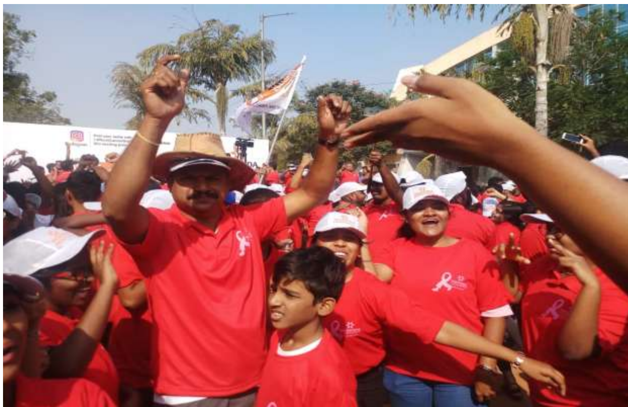
Fig 1: Students and faculty participated at 5K run at Malakpet, Yashoda hospitals

The NSS Cell - SNTI organized a 5K RUN “RUN TO BEAT CANCER” in association with Yashoda hospitals on the eve of WORLD BREAST CANCER on 15-02-2017 . The main objective is to create awareness and remove the stigma and fear attached and help people recognize the early signs and symptoms of cancer, thus enabling them to seek treatment at an early stage. About 23 students participated in the program.