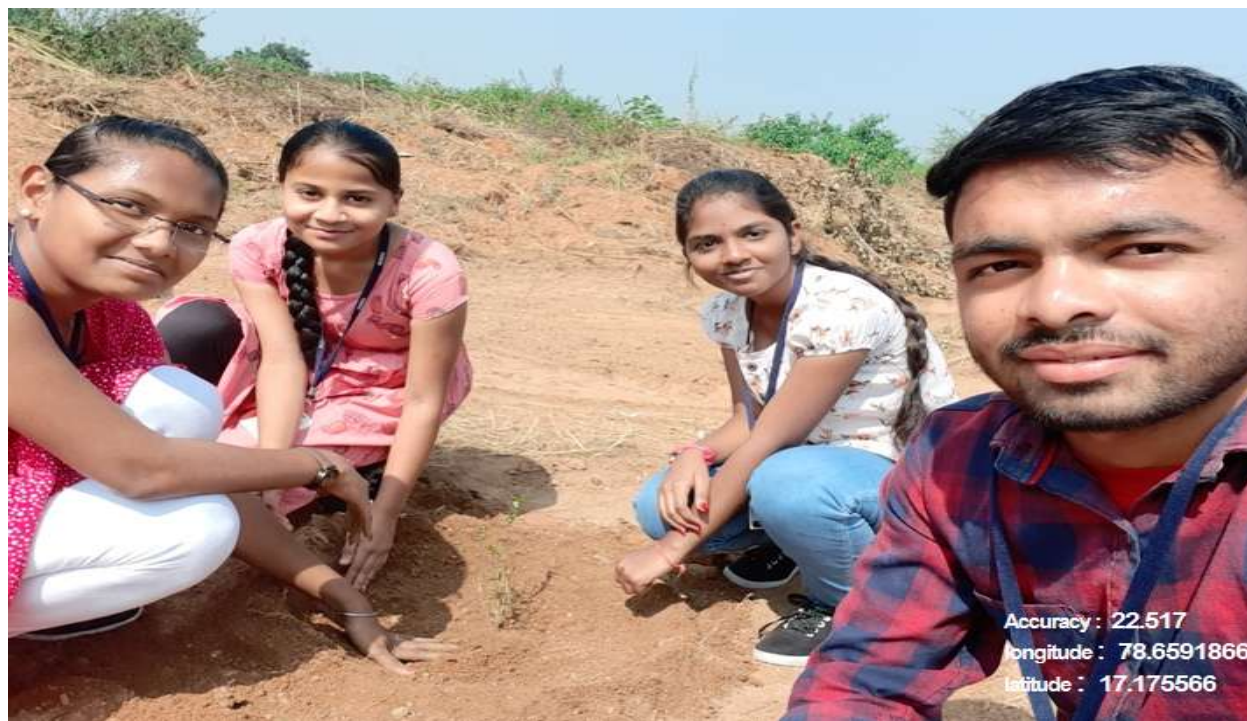
Fig 1 : Students planting saplings at Harithaharam