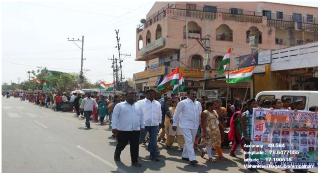
Fig 1 : Students rally on pulwama martyrs