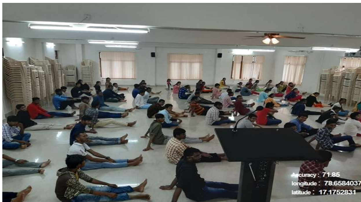
Fig 1 : Students participated on Yoga day

The NSS cell - SNTI has conducted a “ International Yoga day ” on 21-06-2019 . Yoga expert Mr. Shekar explains the importance of yoga and benefits of yoga. NSS volunteers along with the faculty member have actively participated in the event. We all celebrate the day with a lot of eagerness and joy. It's a very interesting Day for all of us. The experience we got was really amazing and important. About 66 students participated in the event.