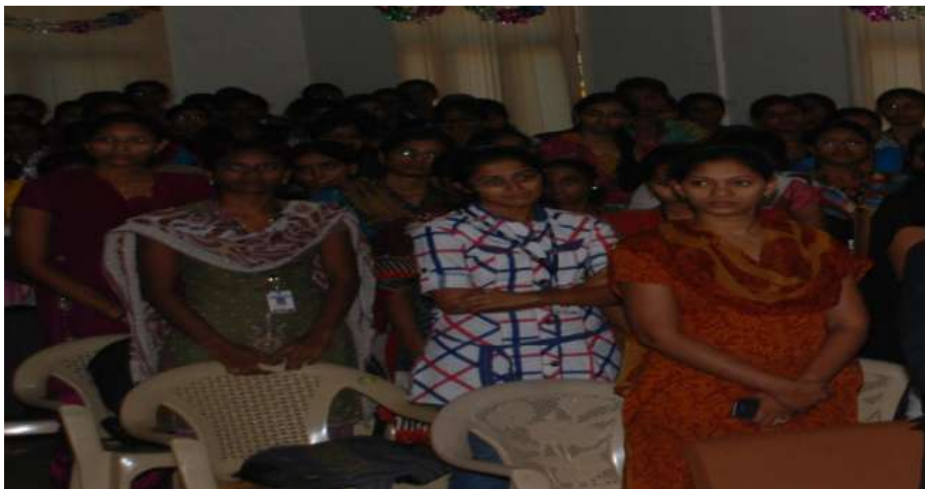
Fig 1 : Womens day celebrations