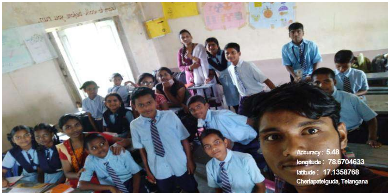
Fig 1: Educational campaign at Cherlapatelguda

The NSS Cell-SNTI organized “Educational campaign at cherlapatelguda” on 23-04-2019. We conducted educational campaigns at TMR school and Junior College, Cherlapatelguda, Telangana and highlight the plethora of opportunities that lay in store for young children. We distributed stationery items to the children. The main motto of this camp to take education to the underprivileged children and empower them for life. About 70 students participated in the event.