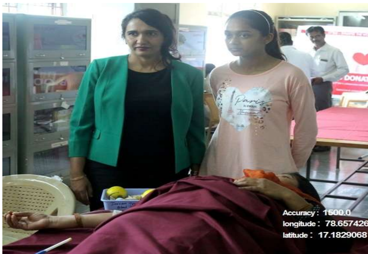
Fig 1 : Students donating blood

The NSS Cell - SNTI organized BLOOD DONATION CAMP in association with RED CROSS SOCIETY on 05-03-2019 at our college. Our Secretary Dr.K.C.Shekar Reddy attended the program. There was an overwhelming response from students and other donors a total of 40 units were collected in the camp. About 50 students participated in the camp.