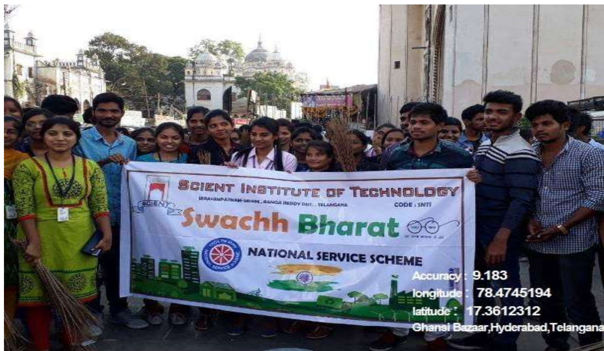
Fig 1 :Students participated in the event at Charminar,Hyderabad

The NSS cell - SNTI organized “Swachh bharat” at Charminar,Hyd on 06-08-2018.The mission was started with the Swachta Pledge. The main motto of this program is to eliminate open defecation and improve solid waste management (SWM).The objectives of the mission also included eradication of manual scavenging, generating awareness and bringing about a behavior change regarding sanitation practices, and augmentation of capacity at the local level.Our NSS Coordinator coordinated with the students.About 45 students participated in the event.