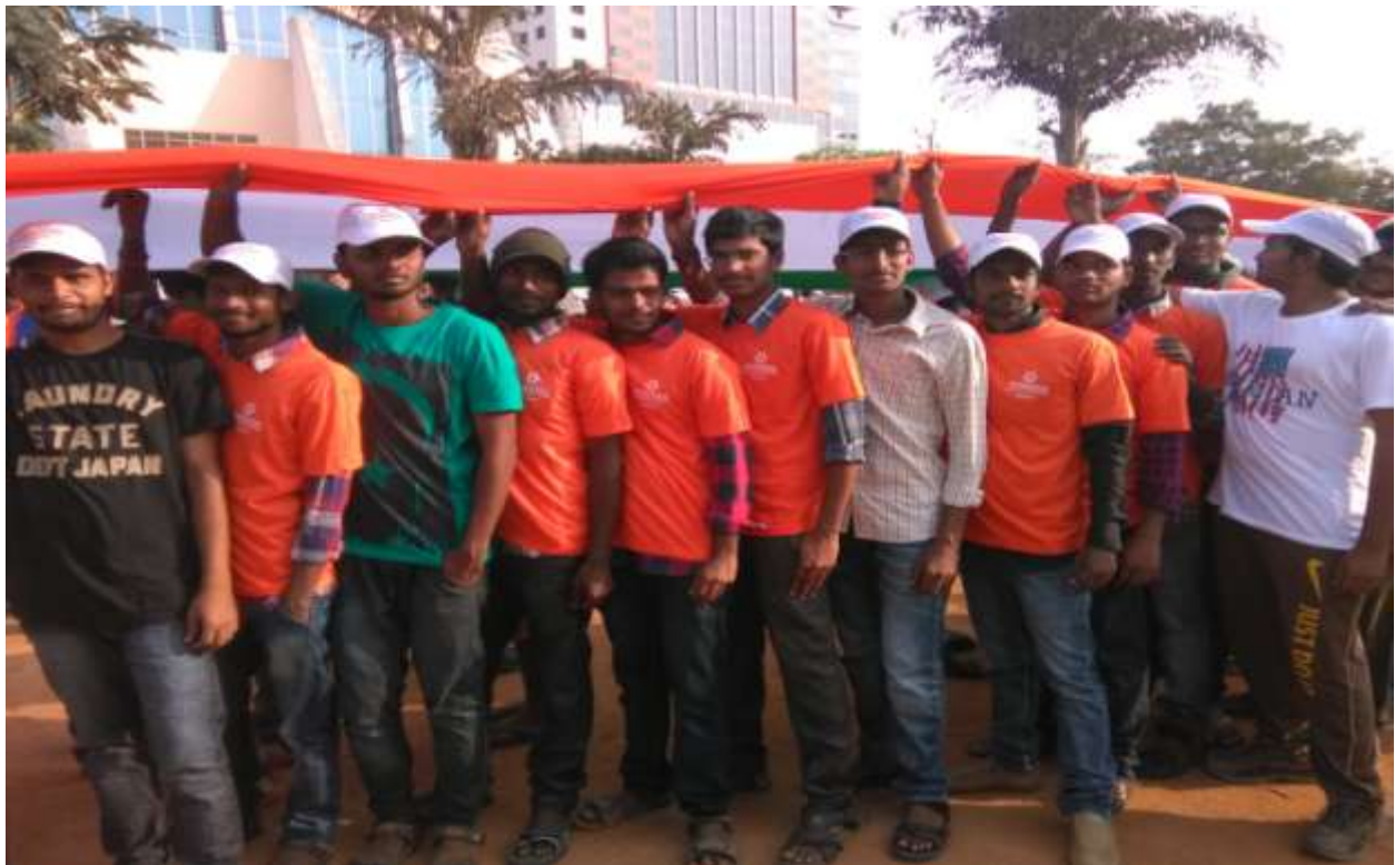
Fig 1 : Students created awareness on cancer at Malakpet, Yashoda hospitals

The NSS Cell - SNTI organized a 5K RUN “RUN TO BEAT CANCER” in association with Yashoda hospitals on the eve of WORLD BREAST CANCER on 14-05-2019 . The main objective is to create awareness and remove the stigma and fear attached and help people recognize the early signs and symptoms of cancer, thus enabling them to seek treatment at an early stage. About 28 students participated in the program.