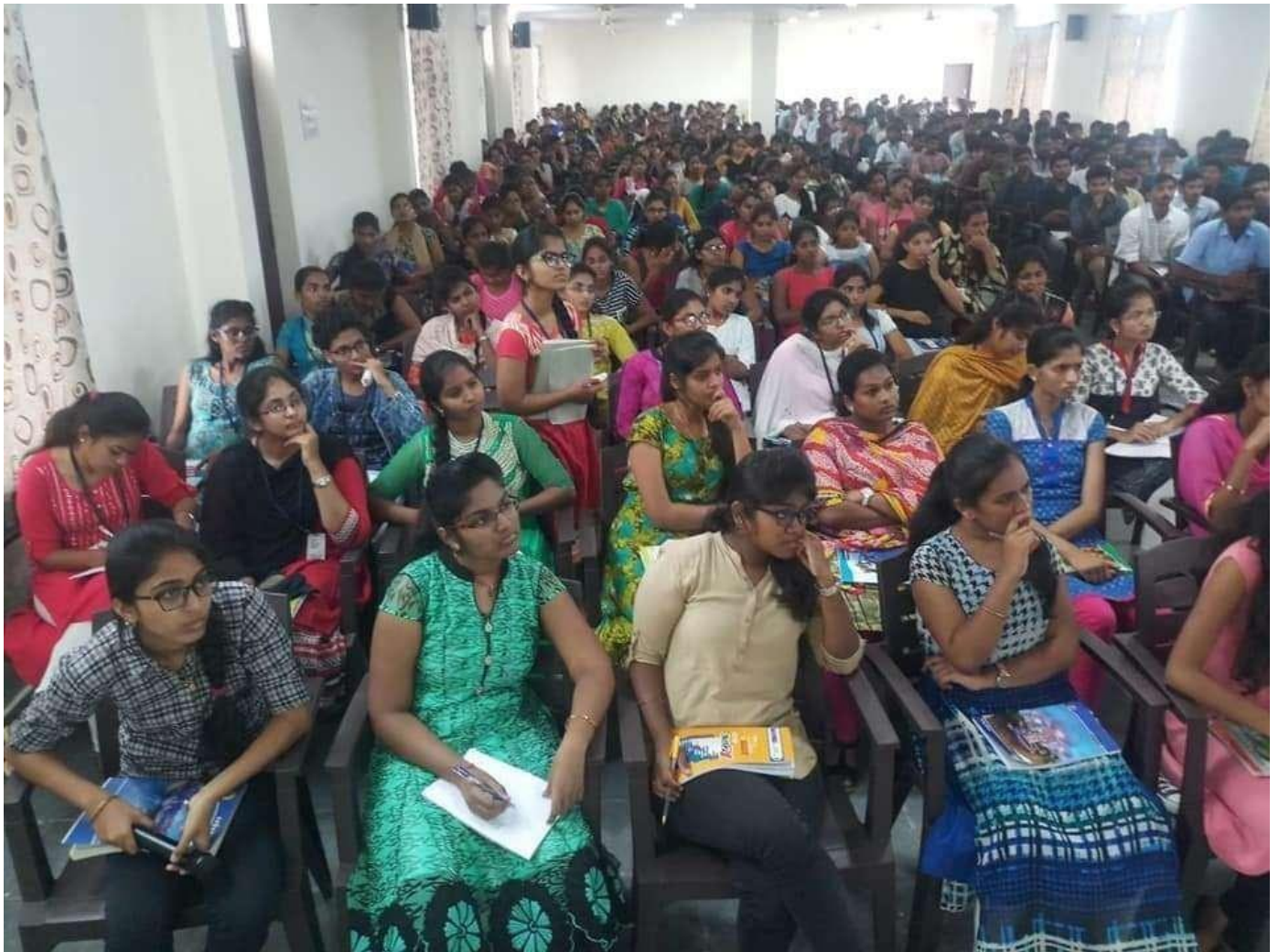
Students participating in digital marketing session

Place of Conduct: SCIENT INSTITUTE OF TECHNOLOGY, Hyderabad.