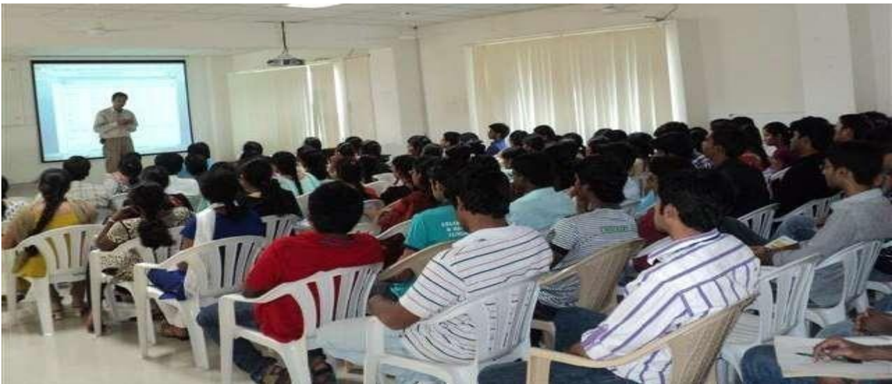
Students attended for the SAP session