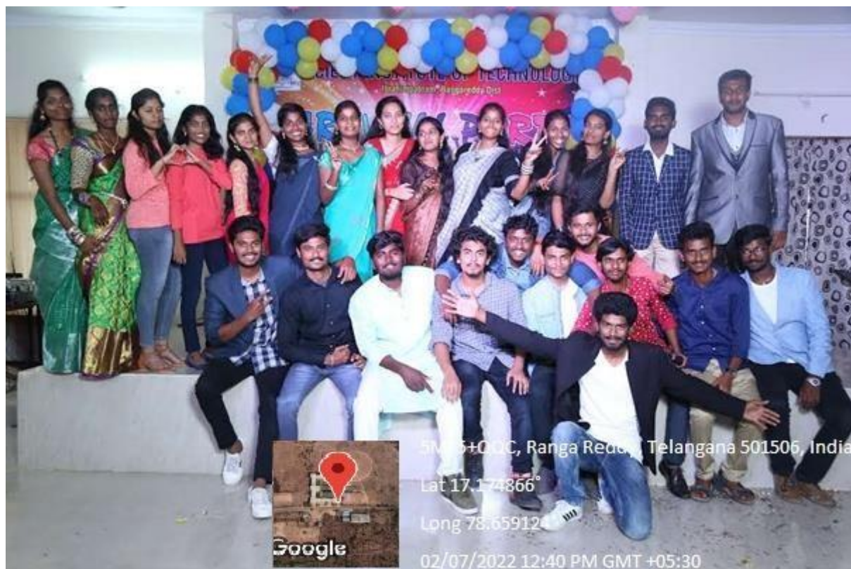
Students group photo in Farewell Day Celebrations