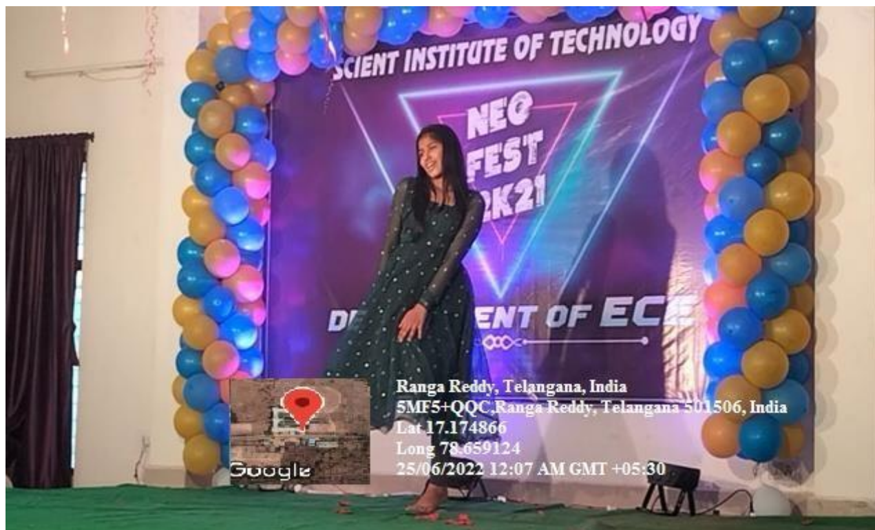
Dance performance by ECE Student