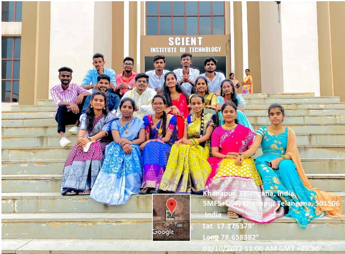
Students performed dandiya during Bathukamma Celebrations