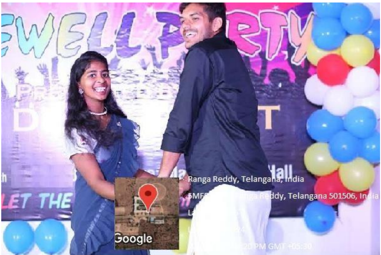
Dancing Performance by the on Farewell Day