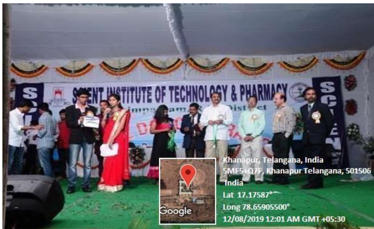
One of the faculty member giving a speech on Youth Day