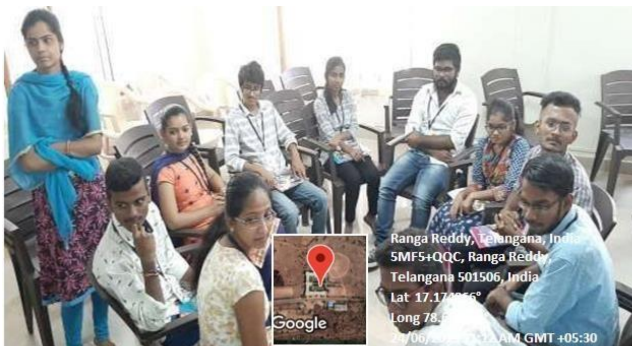
Students performing Drama and mono action

Drama clubs by the students on inculcating the values of past & learning from the great old freedom fighters. The most effective moments in the drama are those that appeal to basic and commonplace emotions--love of woman, love of home, love of country, love of right, anger, jealousy, revenge, ambition, lust, and treachery. In SNTI Drama club encourages the students to strive for a cleaner and healthier mind.