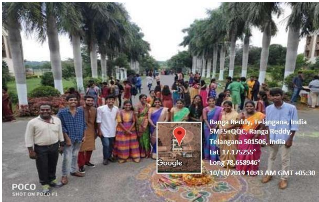
Students have a photo with faculty members on the occasion of Bathukamma