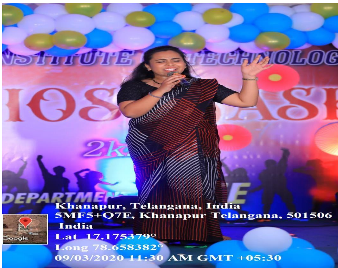
A student from ECE performing a Dance

The club provides a platform to students to showcase their talent in music, dance and other fine arts. It encourages managerial capabilities through event management and stage organization.