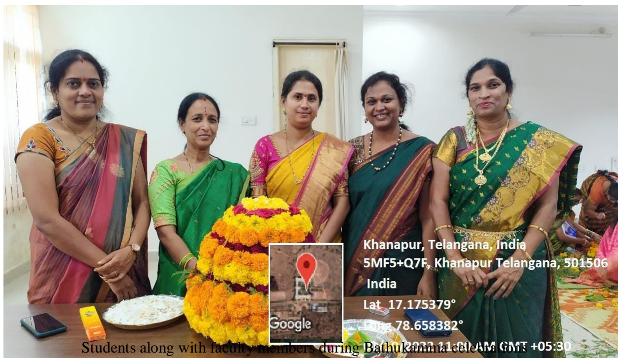
Students along with faculty members during Bathukamma celebration