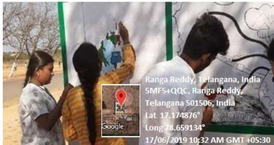
Students participated in the painting competition

This club exists to give the students an artistic outlet and to help enrich and foster an interest for art and personal expression through art. Though the club is for artists, it can be enjoyed by all who appreciate art.