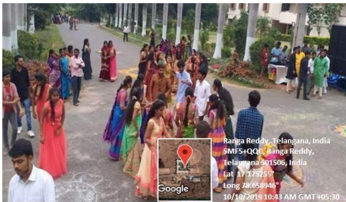
Students from all the departments performing Dandiya on the occasion of Bathukamma

The students and the staff encircled the Bathukammas and danced in unison, clapping and singing to the music of lilting folk songs.