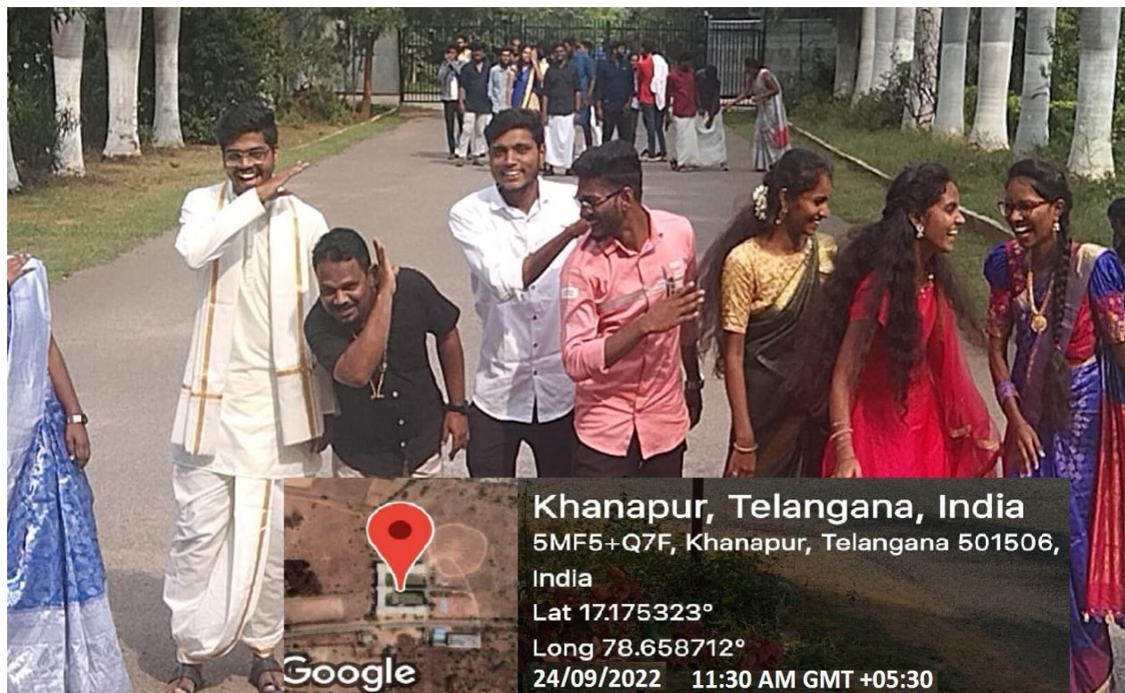
Students along with ECE HOD in Traditional Day

Traditional Day designated for people to come in traditional attire from their home state. The students at the college were dressed in their best ethnic attire. The students from all the departments have actively participated in the Traditional Day Celebrations, and made the event grand successful. A student from CSE department has been awarded with a memento for best traditional attire.